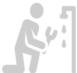
HEATING ENGINEERS/ PLUMBERS