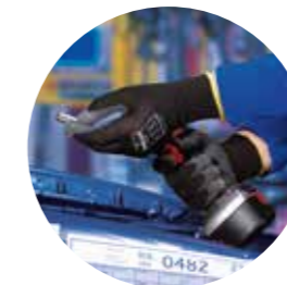
Car roof assembly