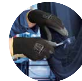
Tyre quality control